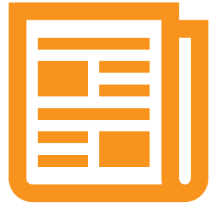
Articles of Dissolution